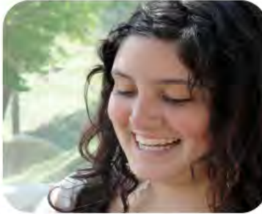
Innovation Grants span the District