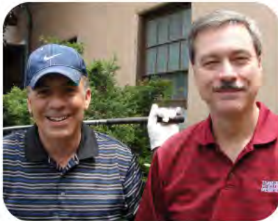
Tee-Up For Education Golf Tournament